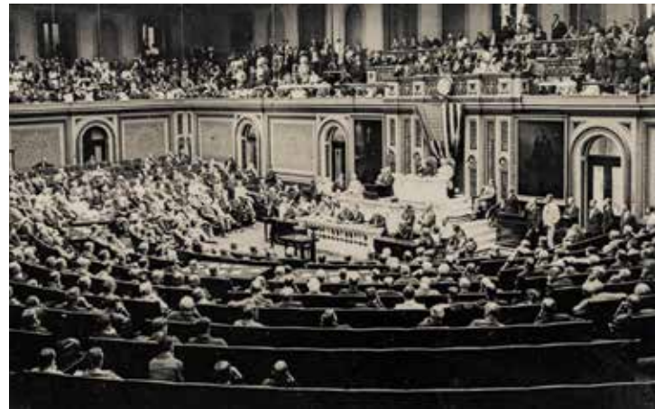
President Wilson addresses Congress on April 2, 1917.

Steel production helped make American and Allied victory possible, as did the actions of American citizens. Men, women, and children bought Liberty Bonds, conserved energy, accepted new jobs, collected scrap metal, and supported the soldiers who returned home. (Continued on Page 9)