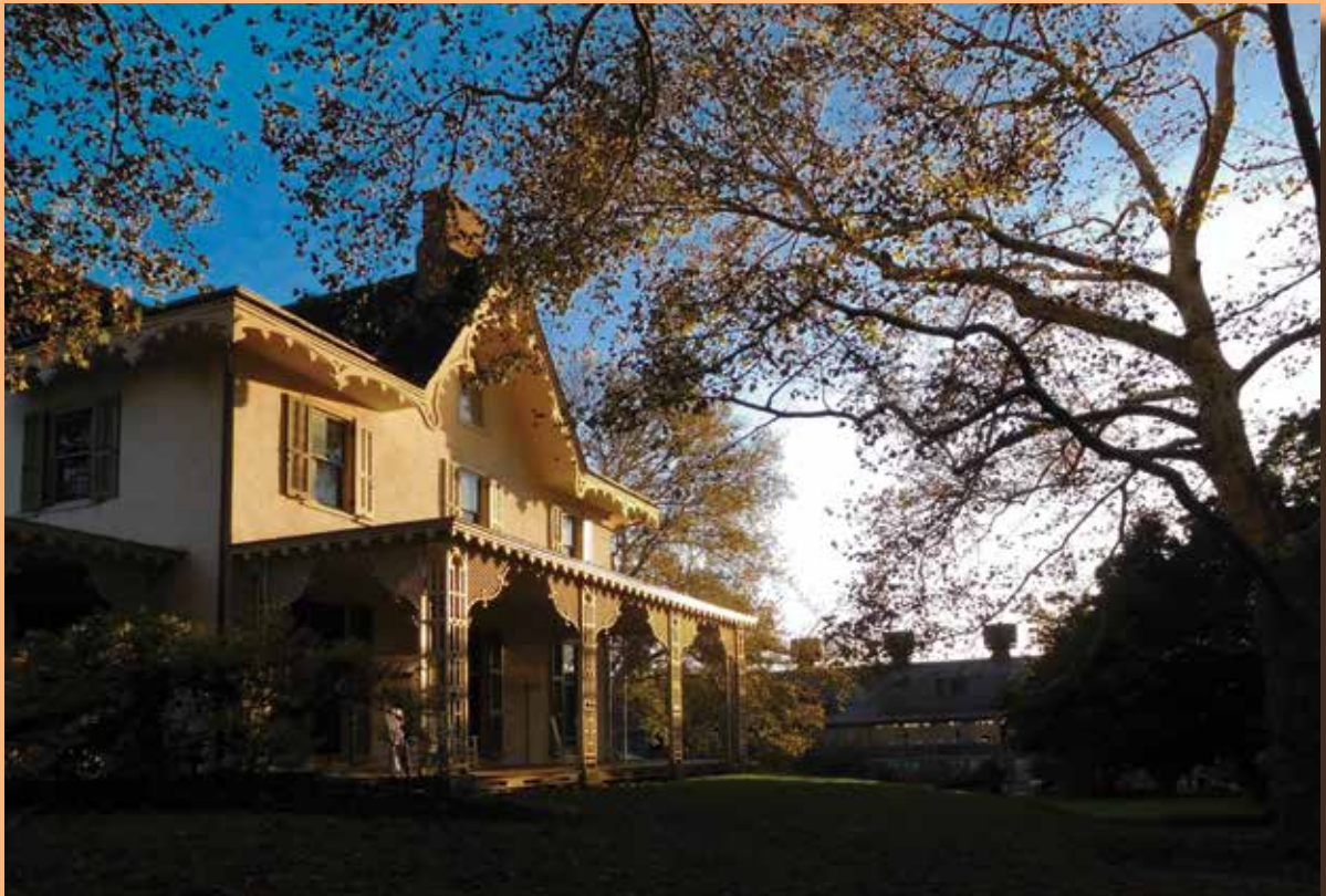
Late in the afternoon, the setting sun bathes our grounds with a yellow glow. Shown above is Terracina, fall foliage, and the 120" mill building in the background.