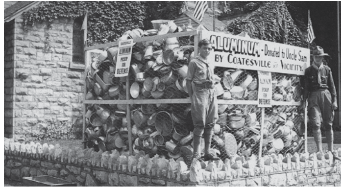
Boy Scouts stand guard over "aluminum donated to Uncle Sam" "Images of Coatesville", Bruce Mowday