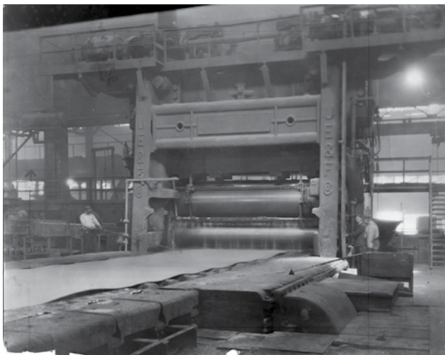
Lukens Steel Company's 206" rolling mill, c1920.